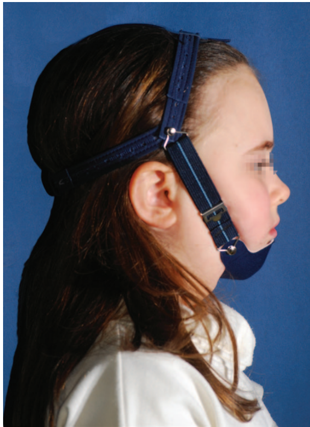
Figure 2. Chincup.

hours per day. The active phase was performed until a positive overjet (2–3 mm) was reached. The average SEC III treatment duration was about 1 year.