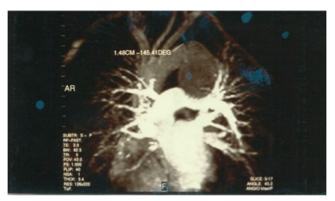
Figure 1: Angio MRI: presence of pseudo-aneurysm of the descending thoracic aorta compressing the bronchus of the left and probably the left recurrent nerve. At the level of the origin of the descending thoracic enjoying a break from the intimate closed chest trauma.

Fiber laryngoscopy showed an immobile left vocal cord in the paramedian position compatible with left recurrent laryngeal nerve paralysis. Further otolaryngological examination showed no abnormality. The laboratory findings were normal. In the potential suspect of an aortic injury, the patient underwent contrast material-enhanced spiral computer tomography (CT) of the chest. Moreover, because of its superior capability in depiction of functional information regarding flow patterns and luminal communications, MR imaging of the chest was also performed. At CT, MR and angioMR imaging a post-traumatic aortic pseudoaneurysm was revealed: concomitant compression of the left broncus was shown as well (Fig. 1, 2). The aortic pseudoaneurysm was consequently repaired by implantation of an endovascular stent graft under local anesthesia. The patient was discharged